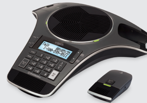
ErisStation® Conference Phone with Two Wireless Mics VCS702

Includes 1 fixed microphone and 2 DECT 6.0 wireless microphones with Orbitlink Wireless Technology™