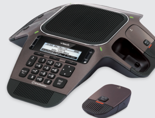
ErisStation® SIP Conference Phone with Four Wireless Mics VCS754

Includes 2 fixed microphones and 4 DECT 6.0 wireless microphones with Orbitlink Wireless Technology™