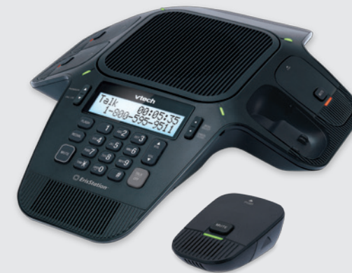
ErisStation® Conference Phone with Four Wireless Mics VCS704

Includes 1 fixed microphone and 2 DECT 6.0 wireless microphones with Orbitlink Wireless Technology™